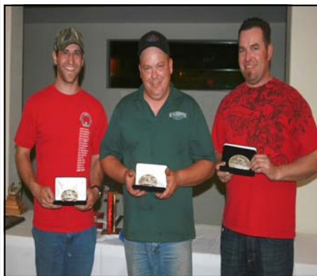
High Point Winners